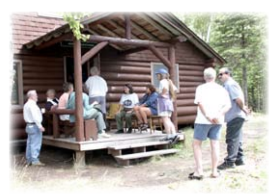
Open House at Noblet Field Station 2002

In the event of inclement weather, the tour will be cancelled. Please call GLC at 337-5476 if in doubt.